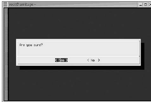
Figure 13.1 A yesno dialog box.

The results can be captured to a variable. Because standard output is used to draw the screen and the results are written to standard error, redirect standard error to a file.