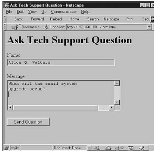
Figure 16.1 The Ask Tech Support form.

The script works for both GET and POST forms. Figure 16.1 shows a picture of the tech support example.