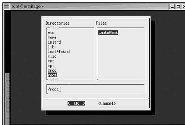
Figure 13.2 A File Select dialog box.